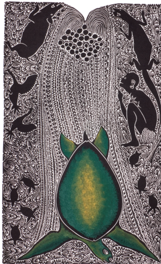
Alick Tipoti, "Waru Thurul" (Turtle Tracks), hand coloured linocut, 22" x 30"